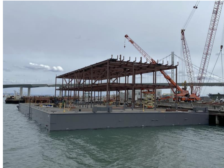
Steel Float and Steel Superstructure at Pier 1, Treasure Island – March 1, 2020