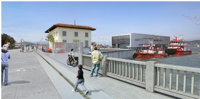
Design Rendering – View of Pier 22½ from the Embarcadero