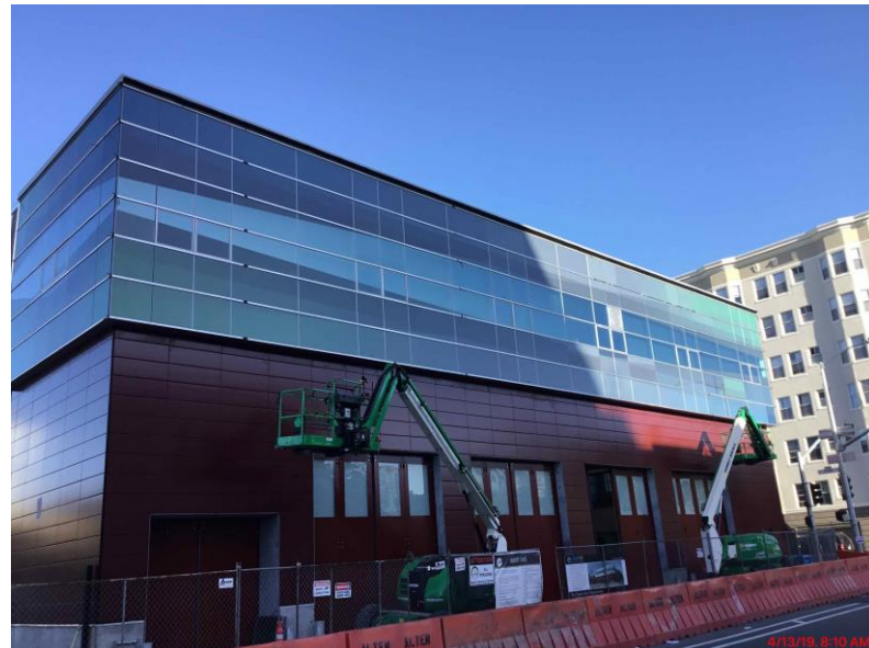
Four-Fold Apparatus Bay Doors at East Elevation (April 13, 2019)