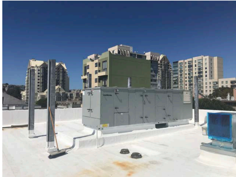
ERVs Units Set at the Main Roof (September 11, 2018)