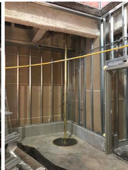
Brass Slide Poles and Landing Mats Installed (September 13, 2018)