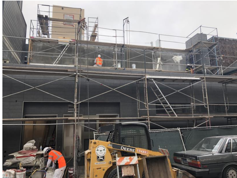
Stone Veneer Tile Panels at South Elevation on Pixley Street (August 22, 2018)