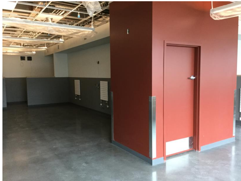
Interior Finishes and Polished Concrete at 2nd Floor Dormitory (August 20, 2018)