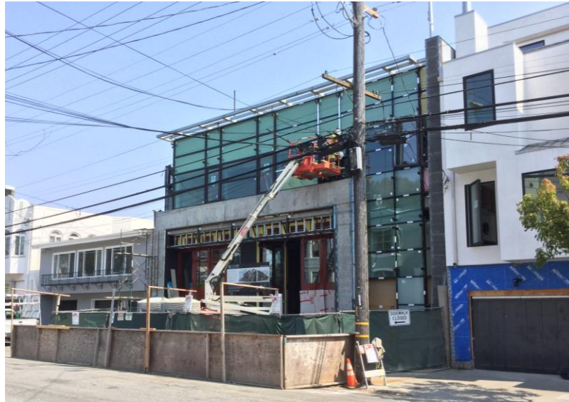
Curtainwall Glazing at North Elevation on Greenwich Street (August 8, 2018)