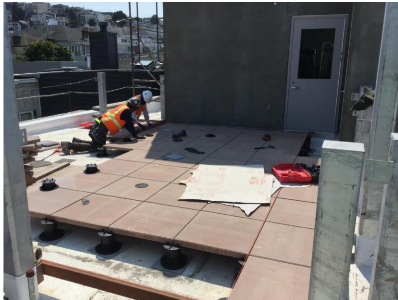
Installation of Roof Deck Pedestal Paver System (August 8, 2018)