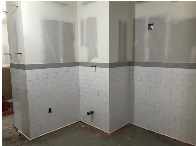
Installation of Ceramic Wall Tile at 2nd Floor Men's Restroom (June 6, 2018)