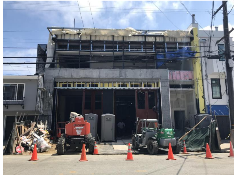
Installation of Curtainwall and Four-Fold Apparatus Bay Doors (June 6, 2018)