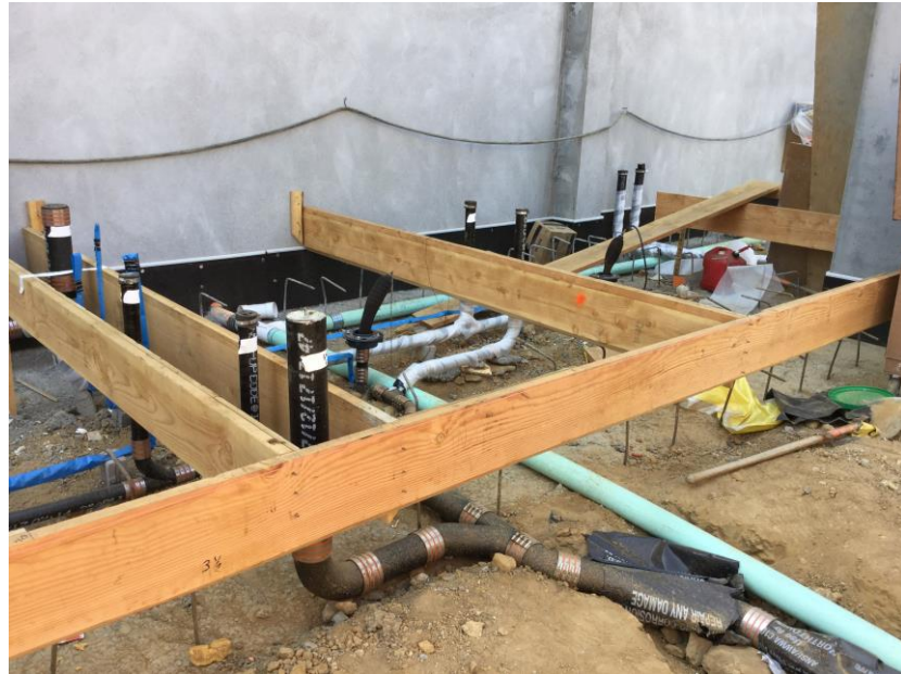
Underground Plumbing at 1st Floor Lower Level (August 31, 2017)