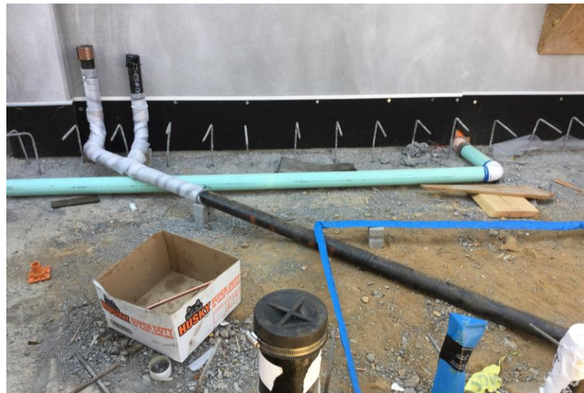
Waterproofing at 1st Floor Lower Level Wall Curbs (August 31, 2017)