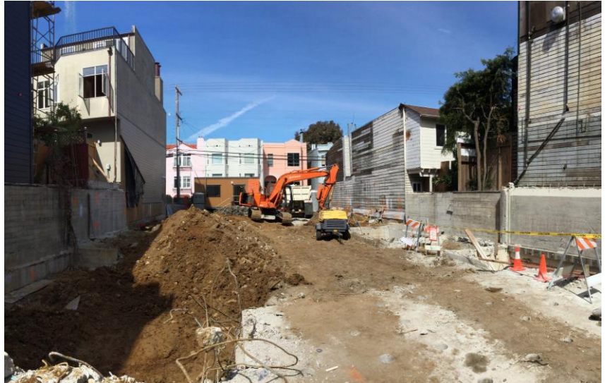
Excavation work and preparation from shoring and underpinning (03.16.2017)