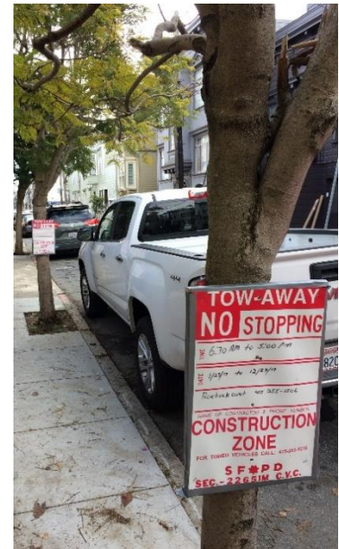
No stopping on Pixley Street directly behind the fire station during construction hours.