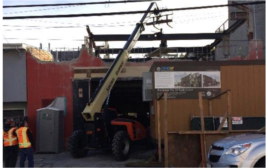
Demolition of structural steel at the roof and 2nd floor using a boom lift (01.06.2017)