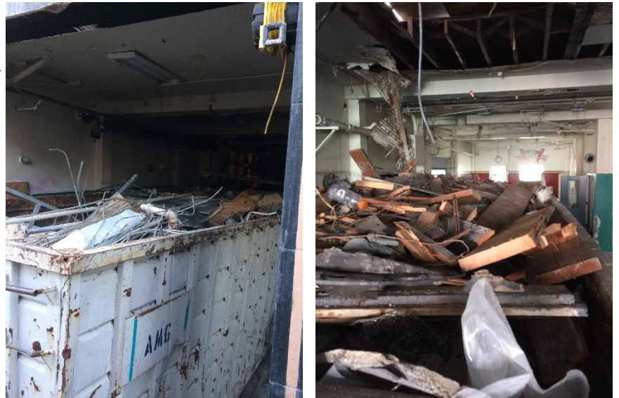
Demolition debris material to be transported to a registered processing facility. San Francisco Ordinance No. 27-06 requires a minimum of 65% of construction and demolition debris to be diverted from landfill.