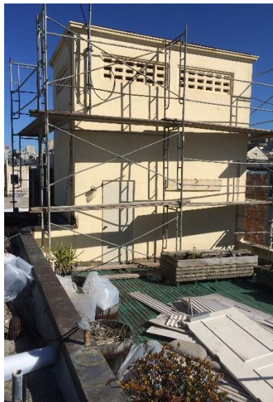
(Left) Hose Tower with Scaffolding at Roof (October 18, 2016)