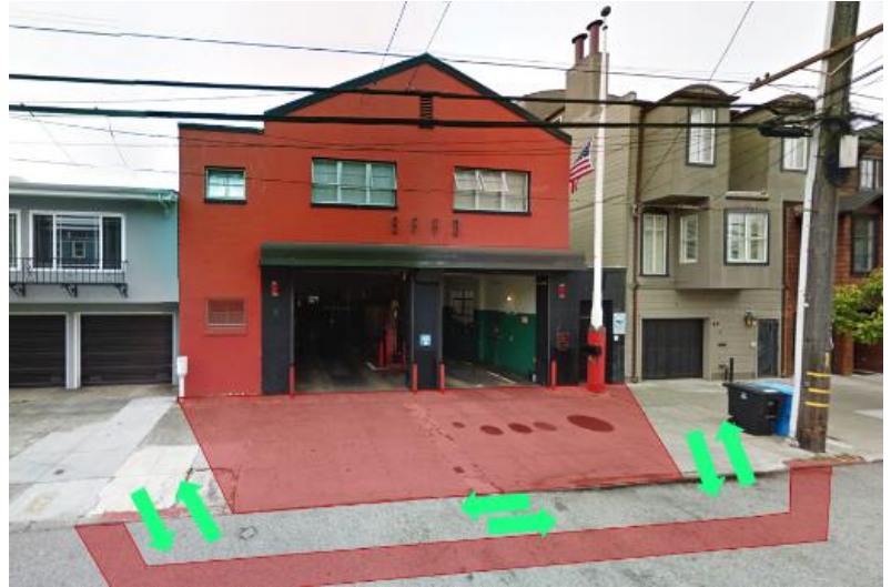
Pedestrian Access Route on Greenwich Street – within Project Site Limits