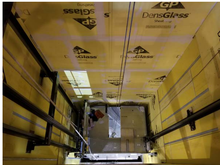
Installation of Elevator (September 7, 2018)