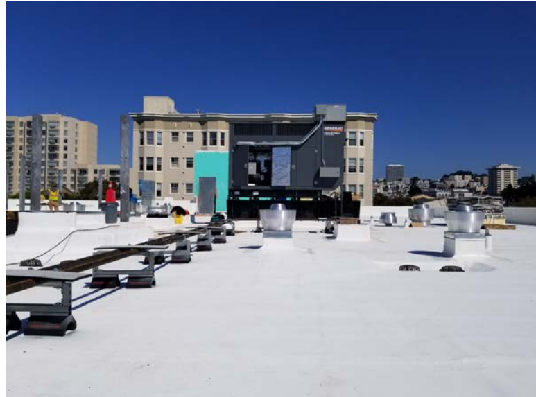
Fuel Oil Piping to Generator at Main Roof (September 7, 2018)