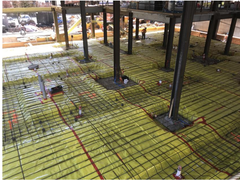
Vapor Barrier and Rebar Layout for Slab-On-Grade (March 28, 2018)