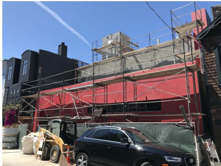
RedGard Waterproofing Membrane Applied to Stucco at South Elevation on Pixley Street (July 25, 2018)