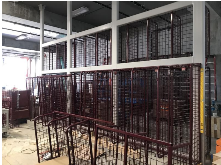
Firefighters' Turnout Gear Lockers in the Apparatus Bay (July 25, 2018)