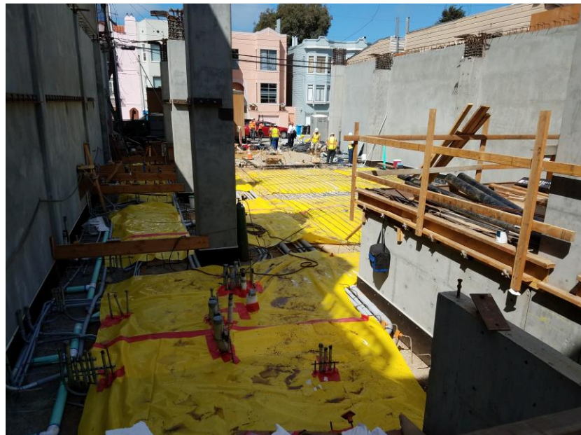
Preparing for Concrete Pour at 1st Floor Lower Level Slab (September 14, 2017)