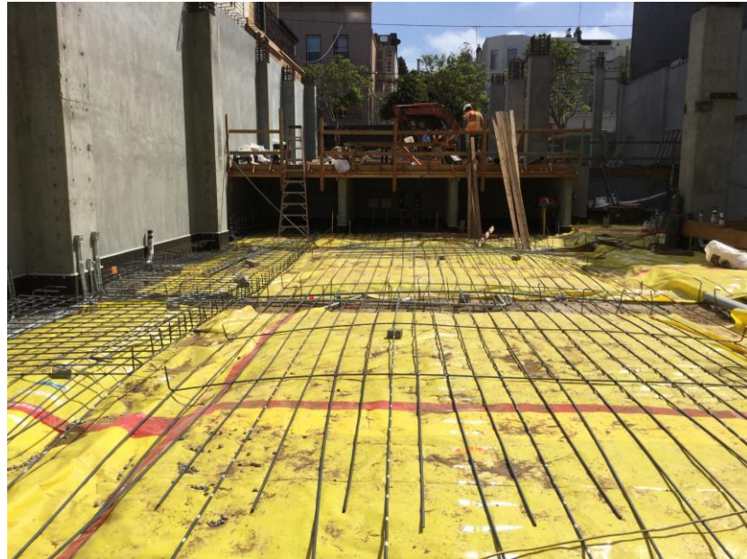
Vapor Barrier at 1st Floor Lower Level (September 14, 2017)