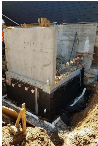
4/20/17: Elevator Pit concrete slab and walls placed.