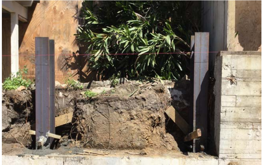
4/20/17: Soldier beams placed along property line as part of the shoring and underpinning work.