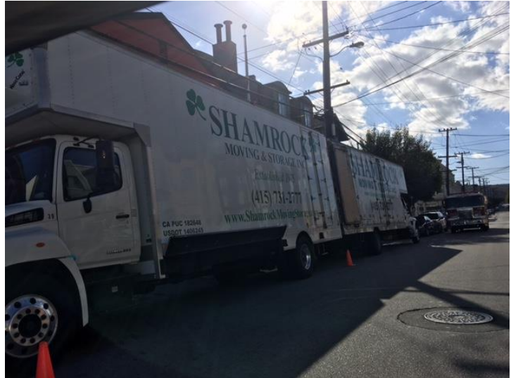
Fire Station No. 16 Move-Out Day [October 4, 2016]