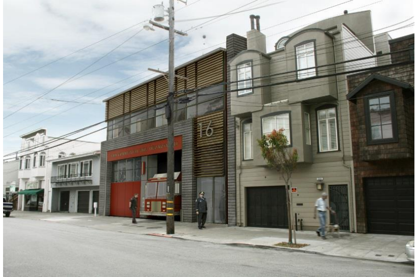
Fire Station No. 16, Northwest View on Greenwich Street