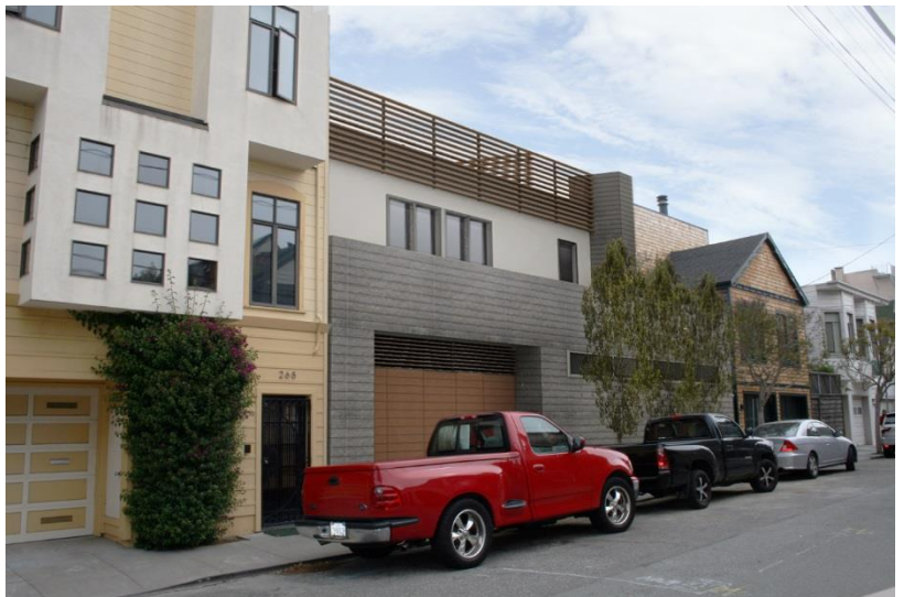
Fire Station No. 16, Southwest View on Pixley Street